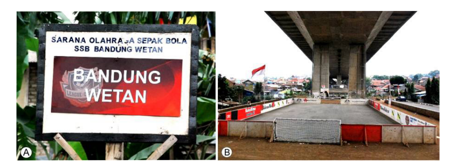
Fig. 9. Futsal sports facilities. Photo by Frans Ari Prasetyo (2012)

Komunitas Taman Kota itself organizes its modest activities, sometimes alongside other community groups, but without major sponsorship, as they are not seeking to promote a particular private interest. Rather, they simply want to share the space so that it can become a true 'Friendship Park' rather than just dead space under the flyover. So, as long as it remains publically accessible they are happy to accept the building of the sports area even though they were not directly involved in its construction.