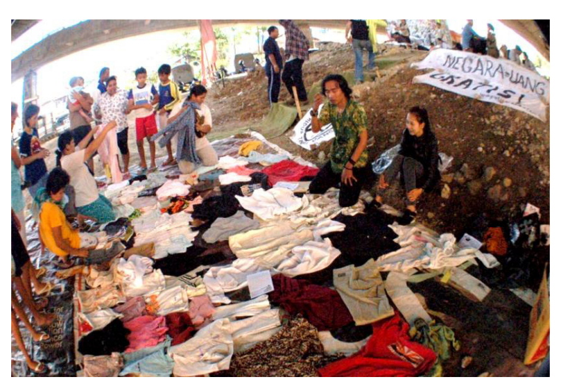
Fig. 8. Lapak Gratis (free stall).

The presence of this self-organized community in the public space under the Pasupati Flyover has also encouraged other people to take the initiative to make effective use of this space. For example, the public gatherings under the flyover encouraged a group to build a mini soccer (futsal) field in the area (Figure 9). Although this involved a third party sponsor rather than the Komunitas Taman Kota, it demonstrates their success in developing the area into a magnet for the public. The addition of further public facilities and amenities can be expected to attract further interest from various groups, including commercial and government interests.