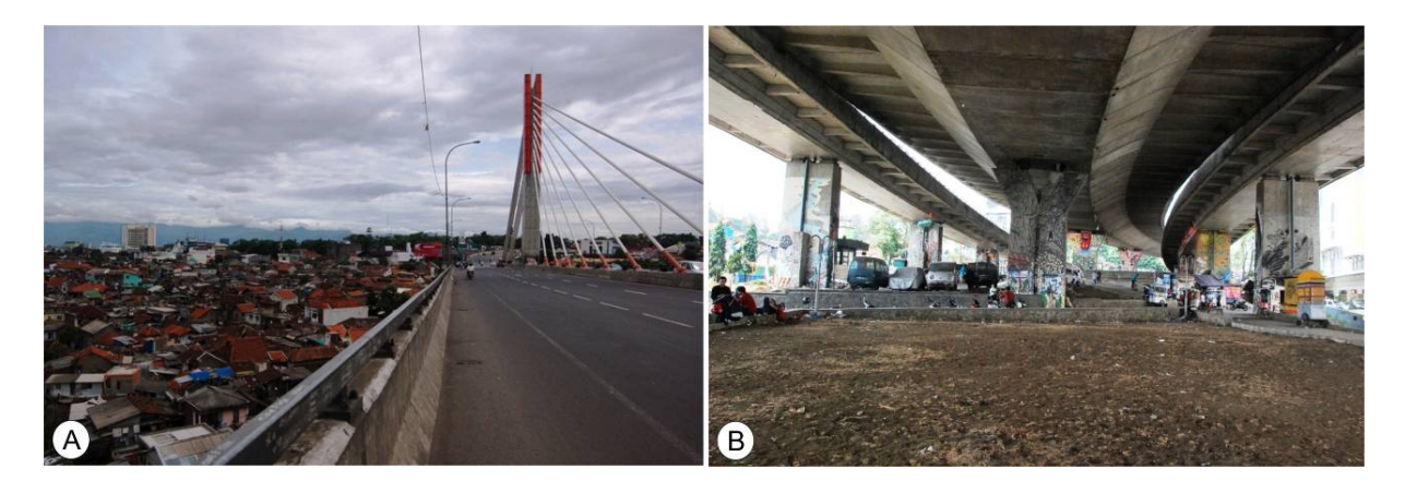
Fig. 1. (A) Upper Pasupati Flyover (2011); (B) Under Pasupati Flyover (2012).

In 2005, the City of Bandung constructed Pasupati Flyover over Tamansari valley and Bandung's main river, the Cikapundung, to connect Pasteur Road in the eastern part of Bandung with Surapati road in the western part. Various impression given to this 2.5 km long flyover, built over 2.4 hectare areas, supported by 46 pillars - as a new icon for the city and an ugly eyesore. Built on the former densely populated Tamansari neighborhood of the Bandung Wetan, it displaced 300 households from RW 04, RW 11, and RW 15. They were relocated to Cisaranten, 10 km to the eastern part of the city (Yasin 2006). Ironically after the construction, the flyover created a zone of 'dead space' across part of the valley where residents had previously established communal, public spaces (Figure 1).