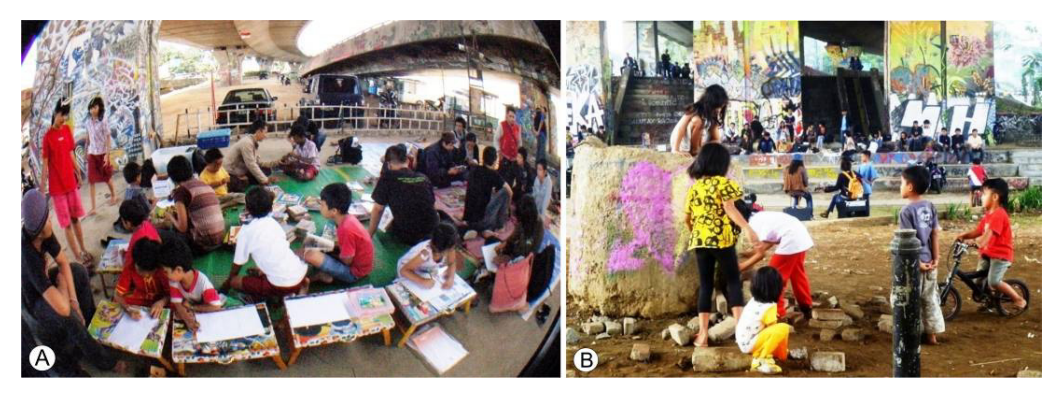
Fig. 4. (A) Sekolah Taman (Point 2 in Fig. 2) involving local residents from RW 04 (2010); (B) Sekolah Taman (Point 3 in Fig. 2) involving RW 11 (2012).

Through the school, children and others are given the freedom to respond to the space under the flyover by using it as a space for activities they enjoy, such as playing, drawing, reading, and more. The Sekolah Taman (Park school) program also draws on the work of a local artist affiliated with Komunitas Taman Kota who, since 2007, has used the flyover structure as a medium for his 'street art' (Figure 5). He has painted or plans to paint murals on 20 of the flyover pillars, starting with the pillar on Cihampelas to Tamansari road. These murals are voluntary works done by a single individual, without any commercial or government sponsorship. In his words, because the flyover provides a blank page, he feels that he has to decorate it.