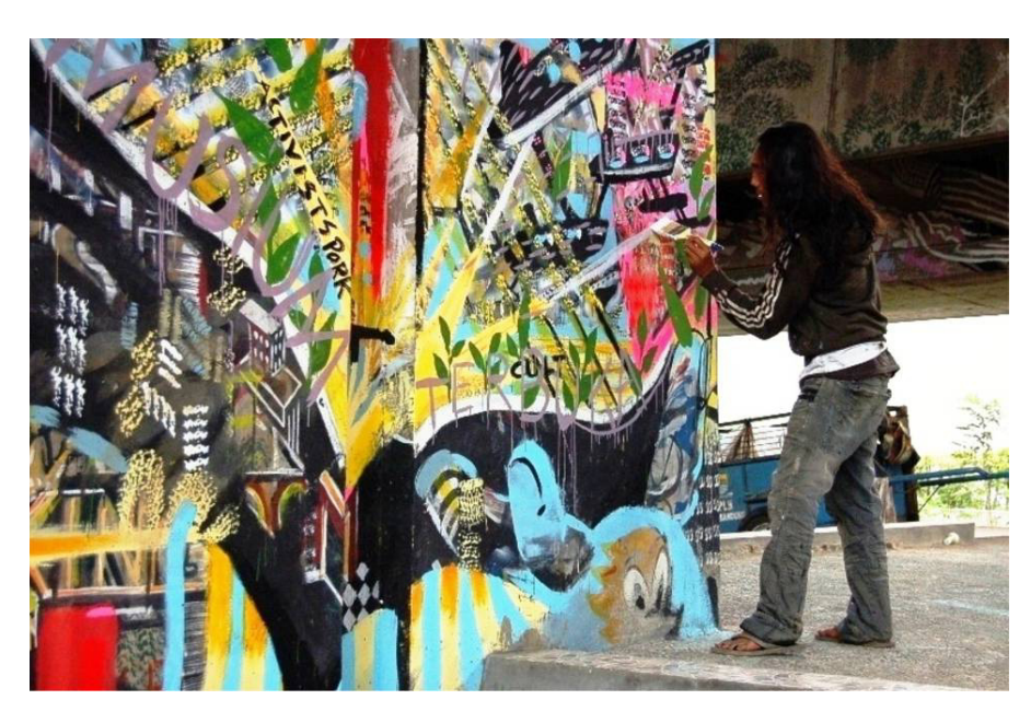
Fig. 5. Local artists create works of art murals on the walls of the flyover pillars.