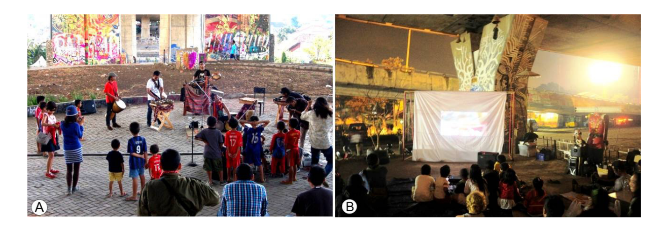
Fig. 7. (A) Filming video clips and workshop (2012); (B) Watching movies together under the flyover (2010).

At Taman Koje, it is not only abstract ideas and knowledge that is shared, but also material objects. Events called 'lapak gratis' (free stalls) are used to give away goods to those who might find them useful or interesting (Figure 8). This activity enabled individuals and groups to display a wide range of goods which they no longer need or want (or that they simply wish to give away for the pleasure of giving) so that anyone may simply take them for free. With the motto 'take what you need and leave what you do not', it is neither strict barter nor a commercial sale but am generalized gift exchange. The lapak gratis follows in the tradition of the 'free markets' which have been organized around the world as an alternative mechanism for exchange.