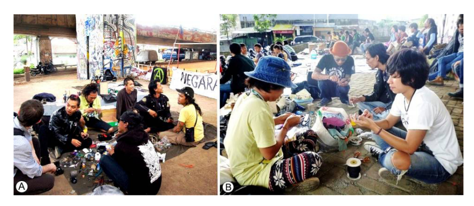
Fig. 6. (A) Punk Collective workshop to recycle electronic goods (2010); (B) Collective craft and knitting (2012).