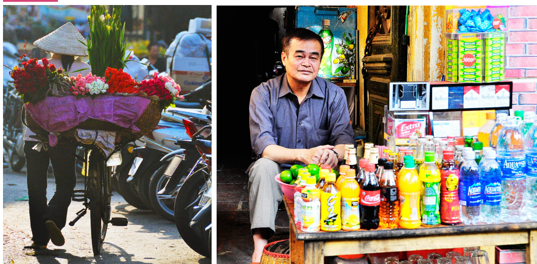
Figure 4 Informal micro business activity in urban areas

Noi and 34 per cent in Ho Chi Minh City (respectively 57 per cent and 41 per cent of private non-farm jobs). The total number of informal household businesses (i.e. informal enterprises or IHBs) comes to 725,000 in Ha Noi in 2009, and 967,000 in Ho Chi Minh City. A breakdown by sector shows a propensity for trade and services (Table 11): services were dominant among informal household businesses in Ho Chi Minh City (55 per cent) and in Ha Noi (52 per cent). Total employment in the informal household businesses amounted to 1,093,000 jobs in Ha Noi and 1,323,000 jobs in Ho Chi Minh City. A significant proportion of informal household businesses operated without premises, including street vendors and motorbike taxis (GSO, 2010: 3-5).