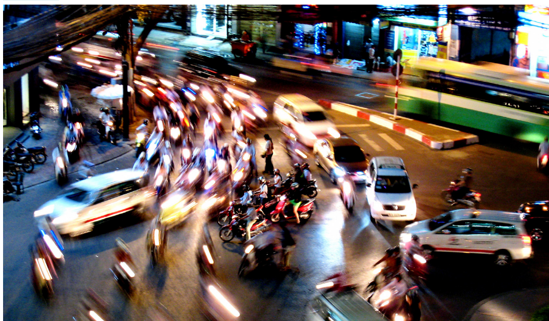
Figure 9 Motorbikes are still main vehicles used in cities in Viet Nam

Growing prosperity is enabling a growing number of urban households to shift from the motorcycle to the car. If this shift accelerates and the car becomes an important mode of transport, cities will face more traffic congestion, longer travel times and more air pollution, while urban road networks are incompatible with the demand for road space by private cars. Constructing new roads or expanding existing ones is mostly done on urban main traffic routes, but the traffic network at inter-regional level is still underinvested. The urban authorities