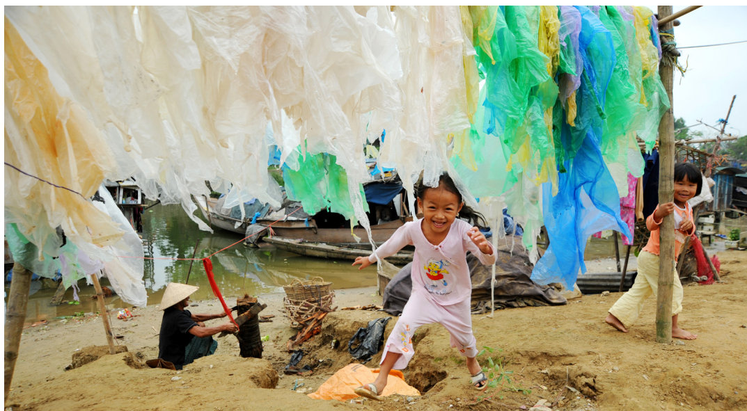
Figure 12 Recycling plastic

Viet Nam has the capacity to respond to the impacts of climate change due to its strong agricultural sector and its long tradition of dealing with natural disasters. The Government has adopted two policies directly related to climate change: The National Target Programme for Climate Change Response (2008) and the National Strategy for Climate Change Response (2011). The National Strategy calls for the establishment of a system to monitor and forecast climate change trends and its impacts in line with