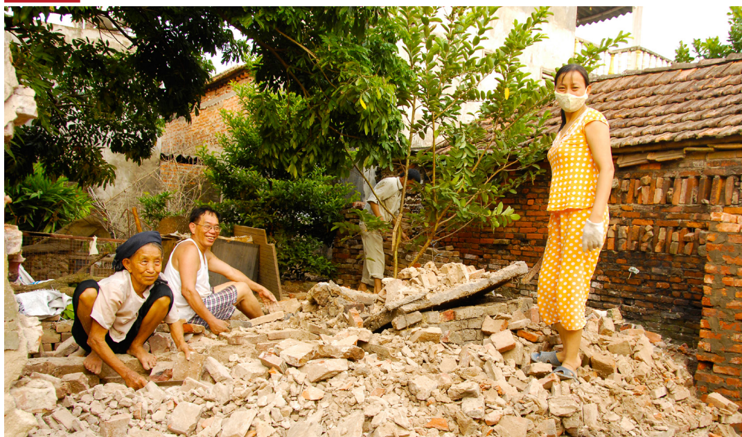
Figure 6 Family members participate in house building

home. The strategy sets the construction of 100 million m 2 of floor area annually as a target until 2020. At least 20 per cent of the floor area in urban housing projects will be set aside for beneficiaries of social assistance and low-income earners. The average floor area per capita in urban areas will increase from 19.2 m 2 in 2010 to 29 m 2 by 2020. Apartments will form a large share of the new housing, particularly in large cities, while rental houses will also be developed.