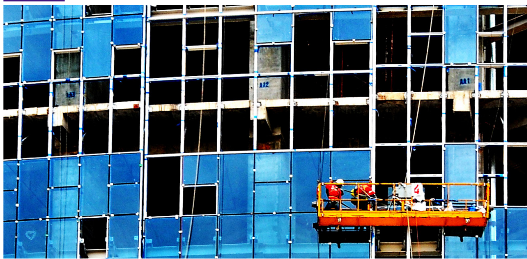
Figure 13 Bustling construction work in big cities

In 2013, the National Assembly approved a new Land Law, to solve the issues, which came about by the enforcement of 2003 Land Law. The issues it addressed include: regulations that specify the government's rights and responsibilities regarding land users; extend the time limit for