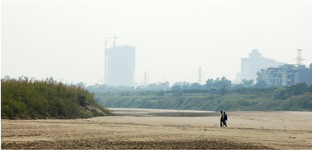
Figure 11 The Red River during draught

Linked to sea-level rise is saline intrusion or increased salinity which is most serious at the end of the dry season during the months of April to July. Due to low water levels in the rivers, high tide could push seawater inland, permeating farmland and reducing yields. Saline intrusion can cause changes in the aquatic eco-systems, damage infrastructure through corrosion and affect groundwater and urban water supply. In Hoi An, it already affects water supply, as water is primarily extracted from a shallow depth. During the dry season, water supply cannot operate 24 hours per day, with interruptions of up to 12 hours. Saline intrusion affects shallow underground water resources which people use when piped water supply is cut. Hoi An residents already reported a loss of rice yields of up to 50 per cent due to salinity (UN-Habitat, 2014: 16, 18).