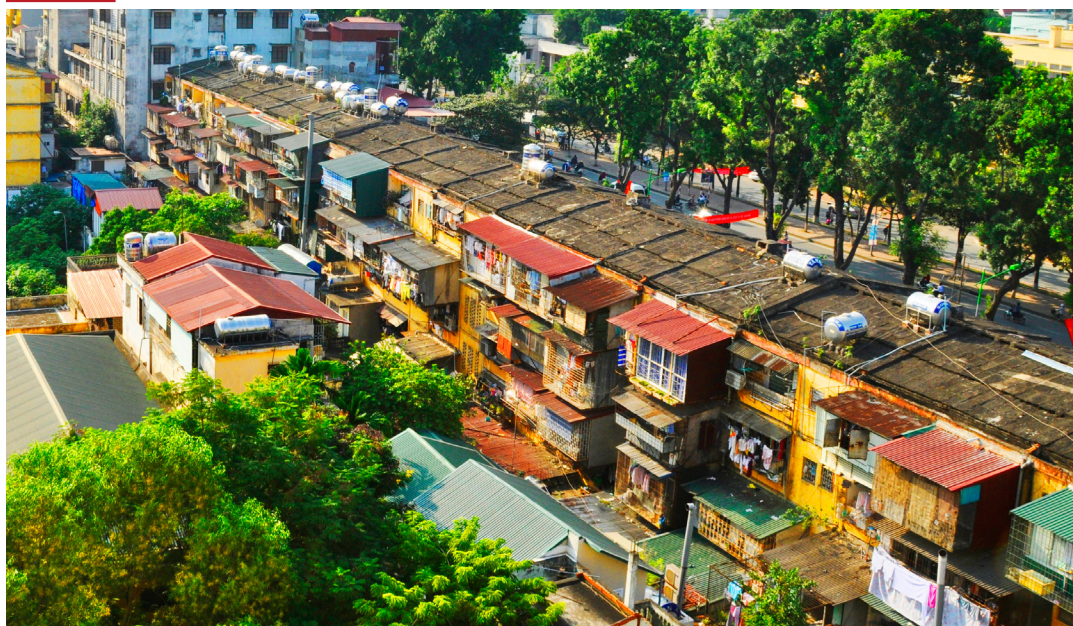
Figure 7 Existing old apartment block built from 1970s in Ha Noi

For resettlement housing, the city made land available and its architecture office produced the designs; actual construction was outsourced to state-owned enterprises. The preferred design was a high-rise building (G+5 to G+12) with apartments of 30-42 m 2 . Planners argued that high-rise buildings provide the required density due to the scarcity and high price of land. The apartments