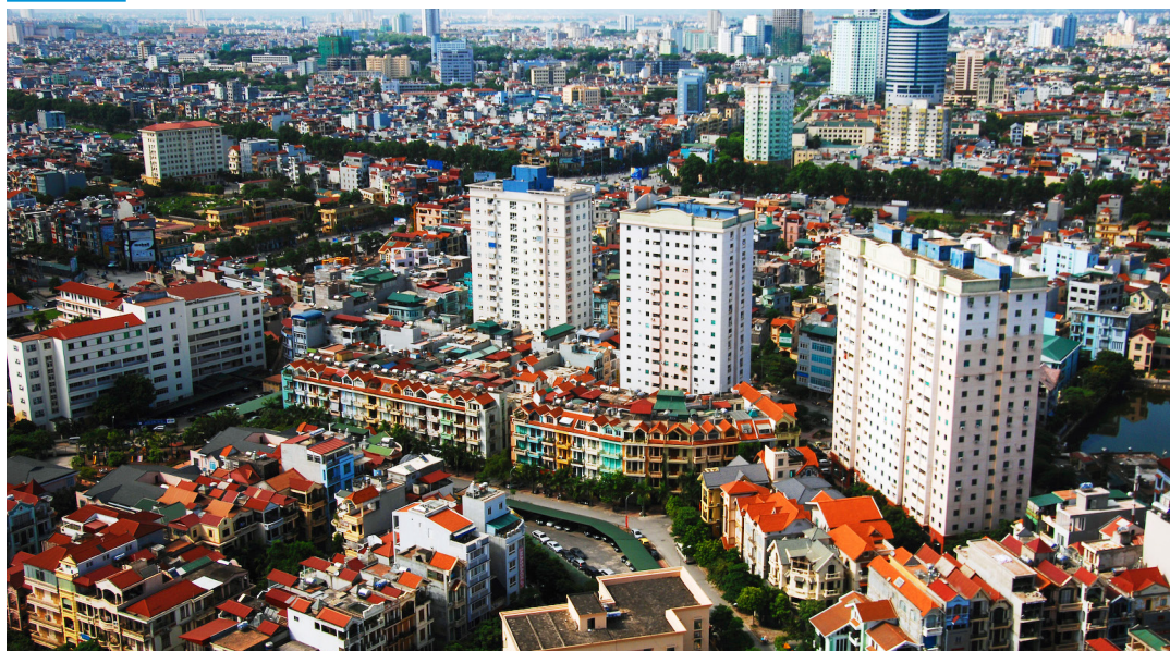
Figure 2 New urban area at the South of Ha Noi

If they are not registered locally, migrants may not be included in official population censuses, resulting in a gap in population data, with implications for an understanding of the migration processes and its role in socio-economic development, and for an effective management of urban areas. An undercount of rural-urban migrants may lead to under-investment in urban development and an underestimate of the extent of urban poverty. The accurate and up-to-date population data are needed to design effective, evidence-based policies, to address any unmet needs of migrants and to reap the full benefits of migration for development.