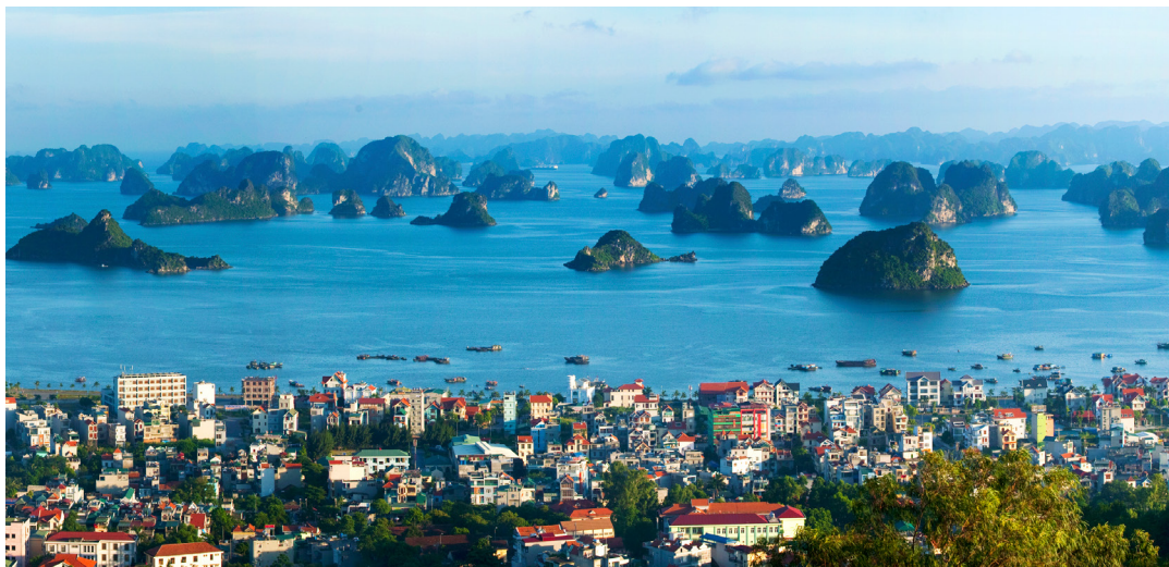
Figure 14 The harmony of urban development and natural beauty at Ha Long City

housing or to start a business. It is confronted with developments that do not conform to the plans and may be contrary to accepted norms of human Habitation, environmental concerns etc. Installing infrastructure becomes expensive after unplanned development, as land has to be acquired and households have to be resettled, while space for infrastructure is limited.