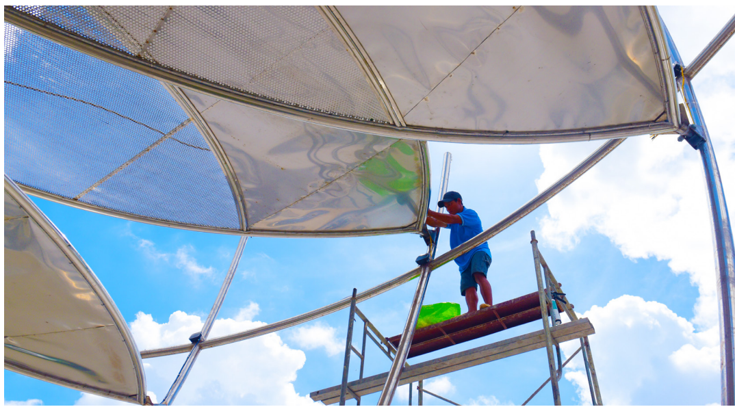
Figure 8 Preparing public lighting

In 2015, 95 per cent of the urban population had access to improved sanitation, while 5 per cent shared a sanitation facility and 1 per cent used another unimproved sanitation facility. This is a very significant improvement from the 1990 situation, when only 65 per cent of the urban households had access to an improved facility, 11 percent used an unimproved facility and 24 per cent of the urban households still practiced open defecation (JMP, 2015: 74). Regulations stipulate that all houses have to have some form of on-site wastewater treatment. Over 90 per cent of the households in large urban areas meet this requirement and have their toilet(s) connected to a septic tank. However, some septic tanks are not functioning properly or are not connected to a