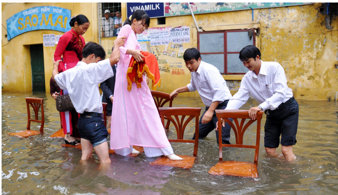
Figure 10 | A wedding during Ha Noi’s flood season | Photo by Nguyen Viet Hung

The Government stresses that harmony should prevail between population growth, urbanization, socio-economic development and environmental protection. However, despite significant achievements in environmental protection, the natural environment continues to deteriorate at a rapid and in some places at an alarming level. Rapid