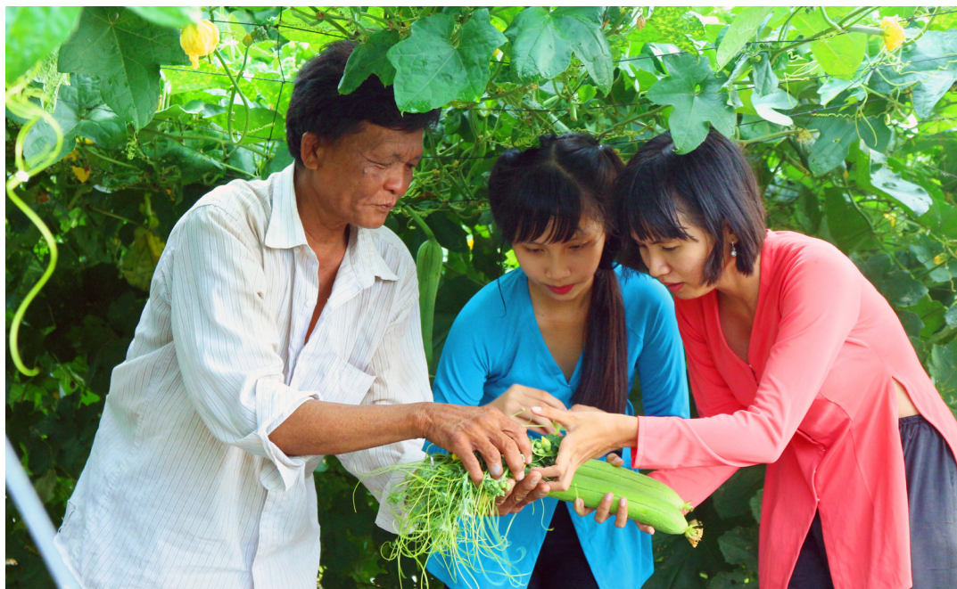
Figure 5 Urban agriculture expanded in major cities

The growth of the urban population and of its standard of living has raised demand for agricultural produce, particularly high-value products such as meat, fish, fruit, fresh vegetables and dairy products. Urban and peri-urban agriculture plays an important role in the urban food system. Peri-urban fruit production has grown rapidly, as farmers