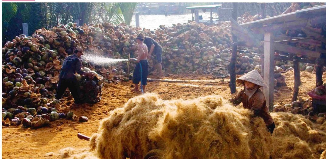
Figure 3 Coconut industry in Ben Tre City

In order to modernize and diversify the economy, urban clusters which have complementary advantages for each other are being developed. Once cities, towns and the rural areas between them are connected through transport and communication networks, they can develop into economic clusters and can accommodate industries, services and transport hubs (such as seaports and airports) that complement each other. The Government is planning clusters around Ha Noi and Ho Chi Minh City, while some provincial governments seek to develop regional economic clusters.