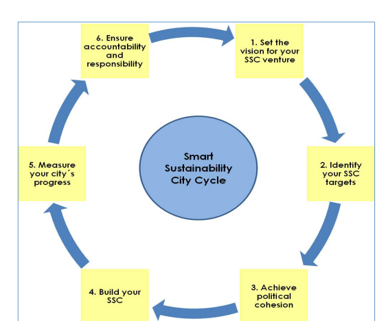
Figure 2: Smart and Sustainable City transition cycle

Robust financial planning: Smart city approaches require robust financial planning and investments, thus need to be informed by knowledge anchored in local context. This requires inclusive governance marked by stakeholder