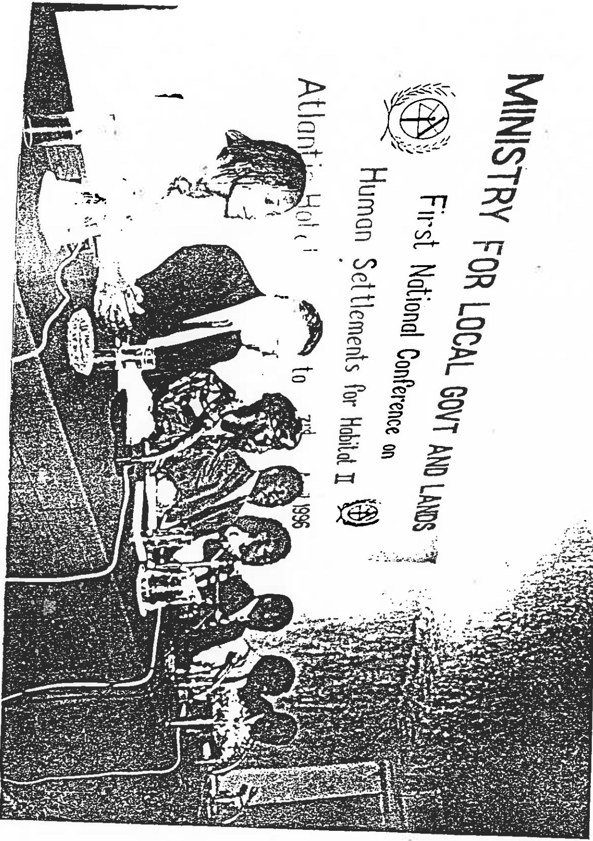
OPENING CEREMONY OF THE FIRST NATIONAL CONFERENCE ON HUMAN SETTLEMENTS FOR HABITAT II